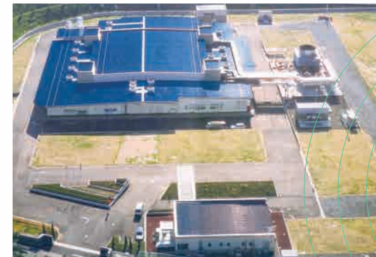
Mie Plant at the time of the company's founding *Photo is as of 1987.

Under an impeccable production and delivery framework that ensures seamless connection between our plants and distributors by closely sharing information on incoming and outgoing orders, we are committed to delivering high-quality specialty gases to our customers.